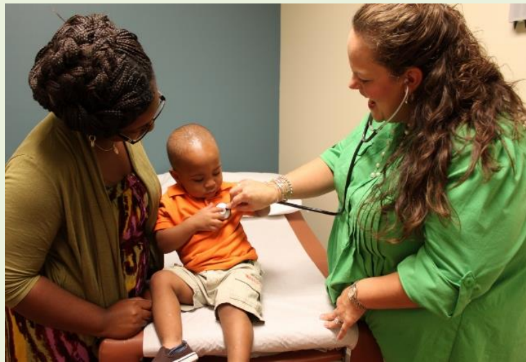
A boy from the Indianola Promise Community receives a routine check-up.

In rural Indianola, located in the heart of the Mississippi Delta, children and families face severe health challenges. Here, infant mortality rates are higher than anywhere else in the nation—and they are particularly high for poor black children. Under the umbrella of Delta Health Alliance Indianola Promise Community, the Indianola Promise Community Early Education Collaborative brings together community resources to create a pipeline of coordinated health-care and educational supports that ensure children ages 0-8 are healthy and prepared to read proficiently by third grade.