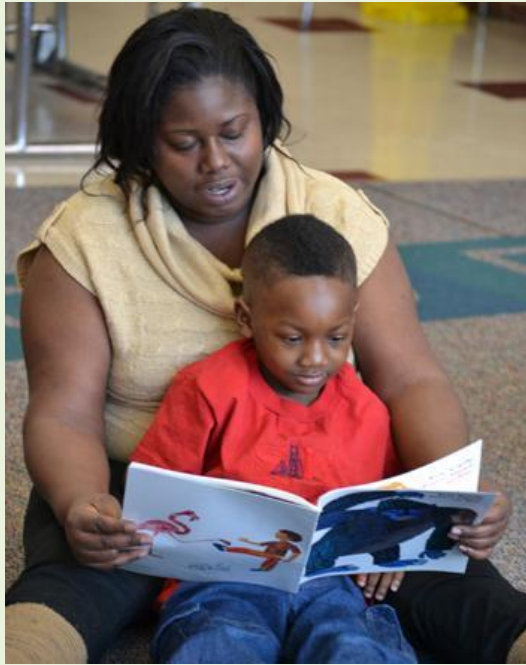
A mother participating in the NAZ Family Academy reads to her son.