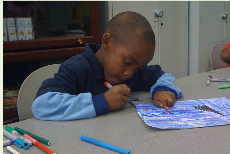
PKZ boy drawing about "finding his way." linger on a massive waitlist as their children were left behind.

High-quality early learning opportunities are critical to preparing black boys for school and reducing disparities in educational achievement. In Orlando's Parramore neighborhood, however, only 39 percent of children under five years old attended early learning programs in 2006; nearly all of them were black. Formidable barriers kept families from accessing these opportunities. High-quality programs were too costly for most. Families eligible for subsidies struggled to obtain the documents they needed to qualify. Even those that did qualify for a subsidy were forced to